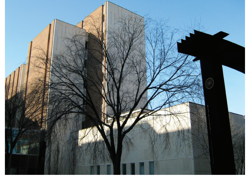
University of Alberta, Chemical and Materials Building

Mechanical was able to deliver an engineered solution that added value to the building owner. Wesmech Sales provided support throughout the life cycle of the project, ensuring success for all parties involved.